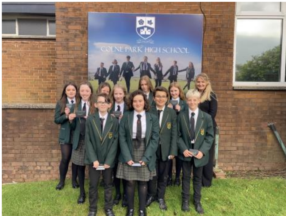
1 - Prize week Highest Number of Credit winners!