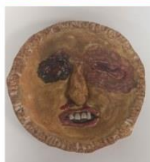
2 nd prize – Amber Welch