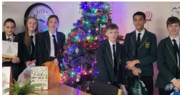
3 - The students of Dragon E took the decision that instead of getting Secret Santa Gifts for each other they would collect donations for those less fortunate than themselves.