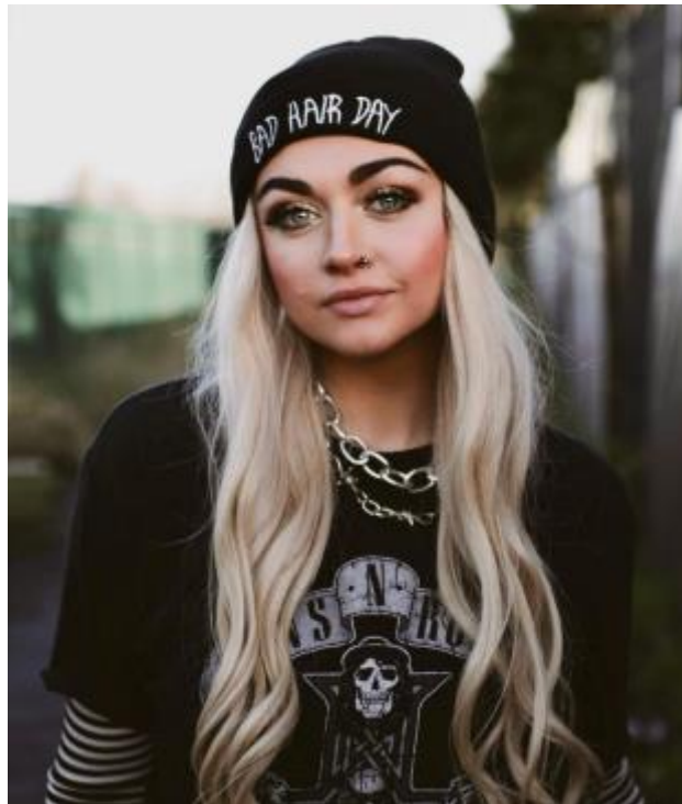
1 - Bronnie Hughs